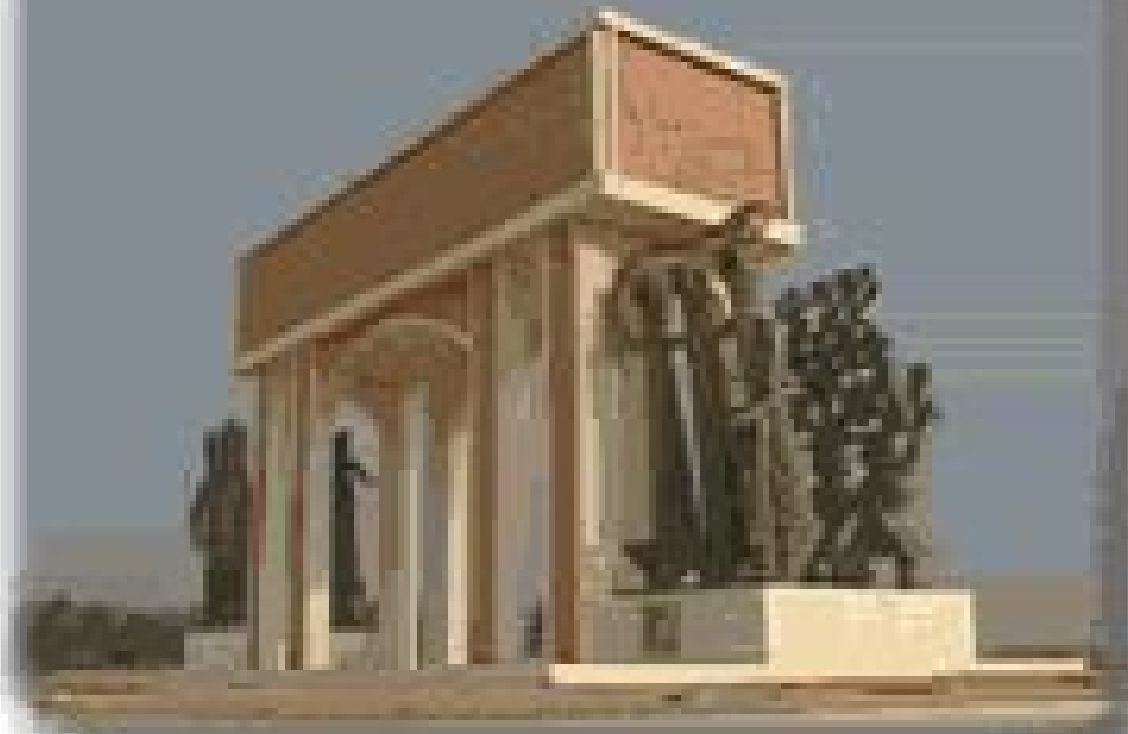
City of Ouidah Gate of Return